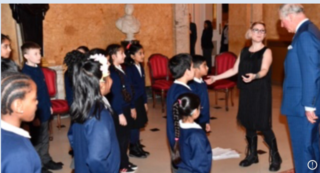
Picture:- HRH Prince Charles with Kensington

Kensington has been awarded Artsmark Silver! This prestigious prize was awarded for how the school has embedded the arts across the school and throughout ALL subjects.