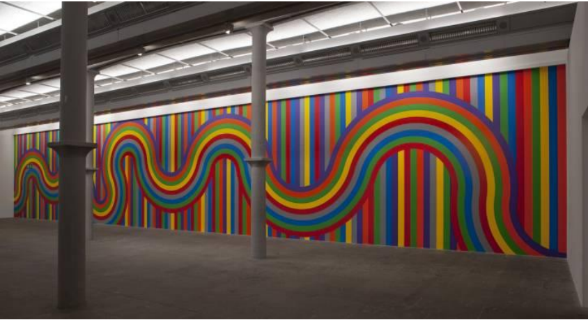
Sol LeWitt Wall Drawing #1136 2004