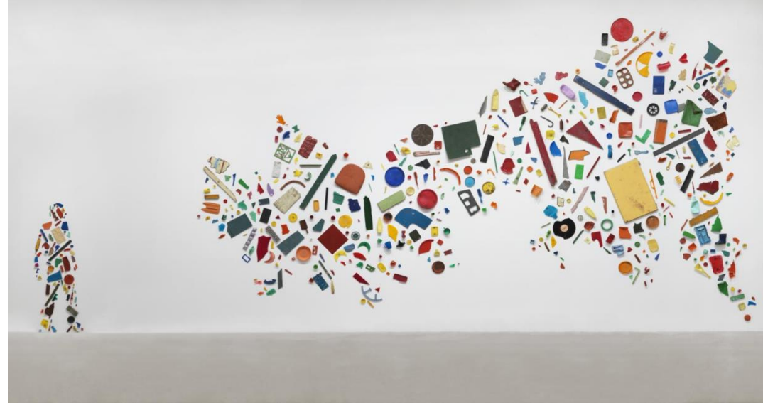
'Britain Seen from the North' Tony Cragg, 1981