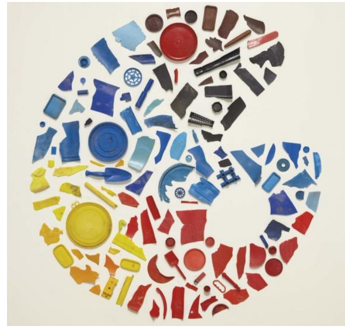
'Palette' Tony Cragg 1984

Being inspired by Tony Cragg's colourful artworks you are going to look at the use of colour and composition to make your own temporary sculpture.