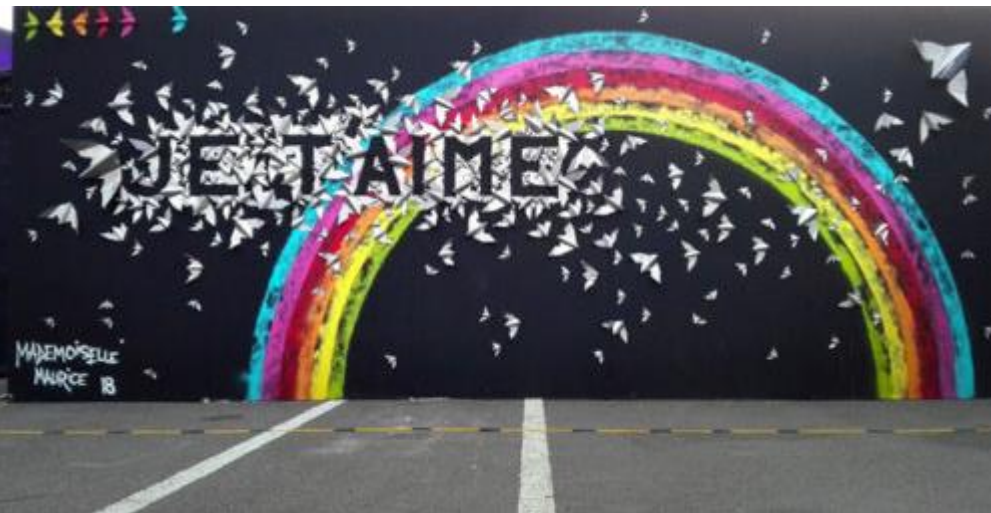
Mademoiselle Maurice Wall with Metal – Jakarta 2018'